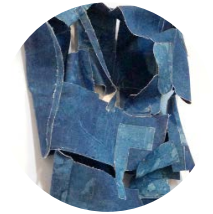
Repel Layer, 2018

Distemper on canvas, thread and found object 70x34x20cm