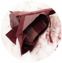
Dripping Layers, 2018

Distemper on canvas, thread and found object 55x55x23cm