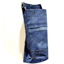
Sicken Skin, 2018

Distemper on canvas, thread and found object 104x45x15cm