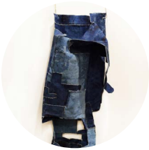
Flayed Sleeve, 2018

Distemper on canvas, thread and found object 93x72x30cm