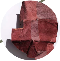
Grafting Piece, 2018

Distemper on canvas, thread and found object 120x40x25cm